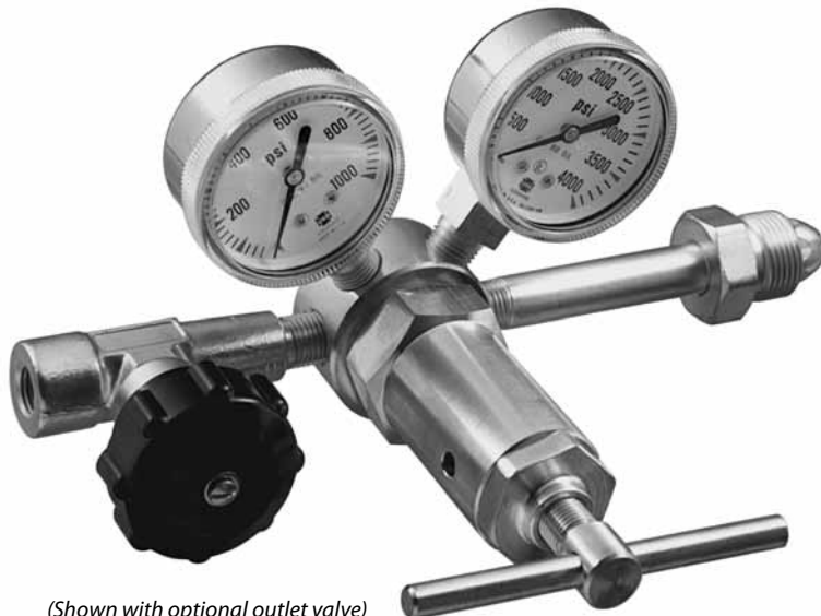
(Shown with optional outlet valve)

High Pressure Economy Brass Cylinder Regulator