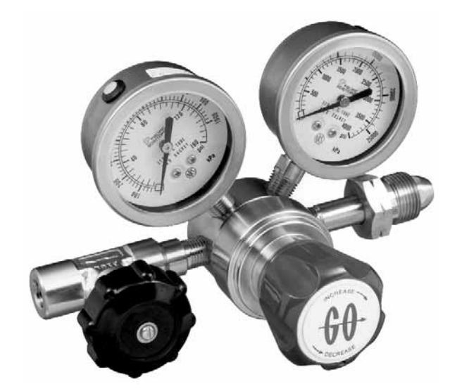
(Shown with optional outlet valve)

Corrosion-resistant Single Stage Cylinder Regulator